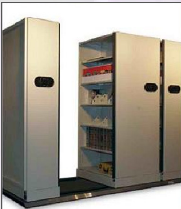
Mobile Shelving (Electronic Power Track)