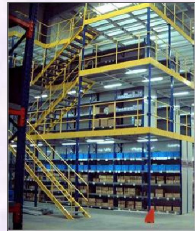
Multi Tier Shelving