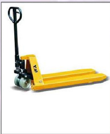
Hand Pallet Jack