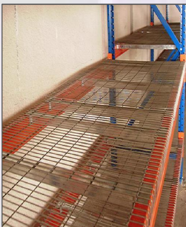
Wire Mesh Decking