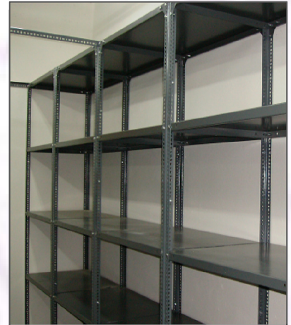
Slotted Angle Shelving