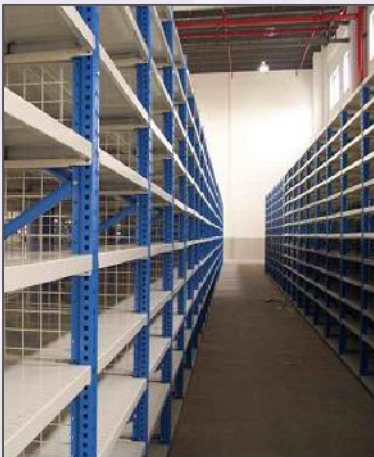
Long Span Shelving