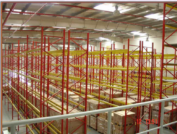
DHL - JAFZA W/H