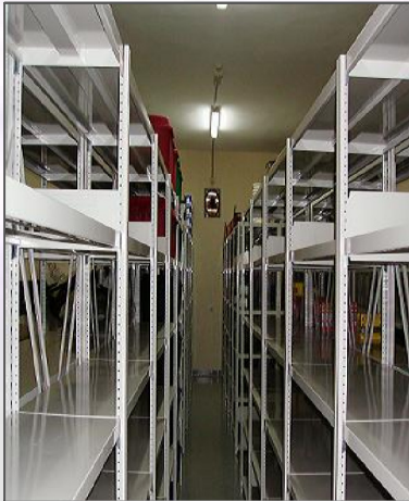
Bolt Free Shelving