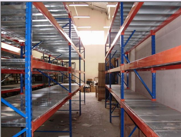
GOVERNMENT OF DUBAI DEPARTMENT OF CHAMBER & COMMERCE