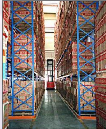
Very Narrow Aisle (VNA)