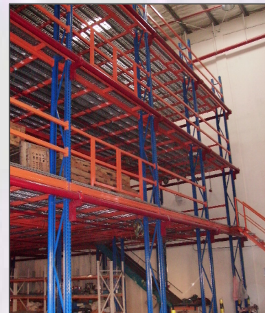
Rack Supported Storage Platform