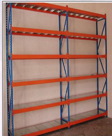
Long Span Racking